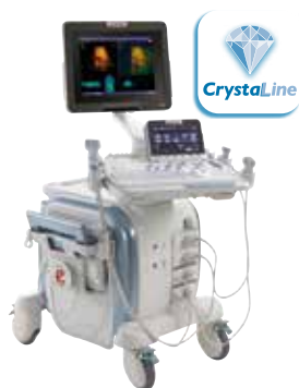
MyLab™Twice eHD technology