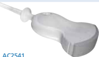
AC2541 Abdominal, Ob/Gyn, Vascular Convex Array