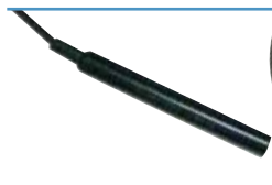
SHFCW Vascular High-frequency Pencil Array