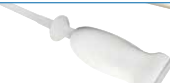
SL3332 appleprobe Vascular, Pediatric, Small Parts, Contrast Agents Procedures Variable-Band Linear Array