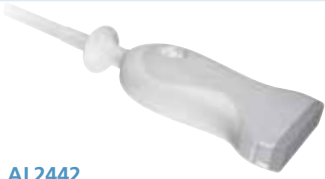
AL2442 Vascular, Abdominal, Cardiac, Ob/Gyn, Small Parts Linear Array