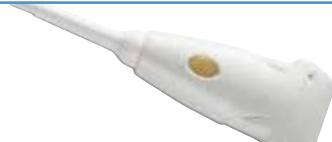
SL2325 Small Parts, Vascular, Rheumatology, Anaesthesiology Wideband Linear Array