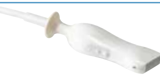
SL3323 appleprobe Vascular, Small Parts, Rheumatology, Anaesthesiology Linear Array