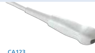
CA123 Neonatal, Abdominal, Vascular Micro-convex Array