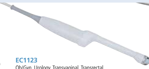
EC1123 Ob/Gyn, Urology, Transvaginal, Transrectal Micro-Convex Array