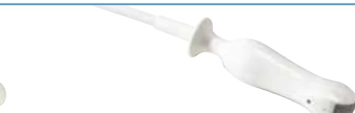
SC3123 appleprobe Anaesthesiology, Pediatrics, Vascular Micro-convex Array