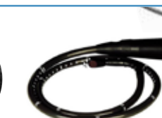
TEE132 Multiplane Cardiac, Pediatric Phased Array