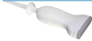
LA533 appleprobe Small Parts, Vascular Linear Array