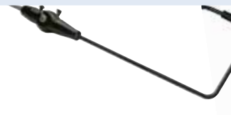
LP323 Laparoscopic, Vascular Linear Array - Articulation: ± up/down 90°; right/left 90°