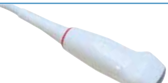
SP3630 Cardiac, Transcranial, Abdominal, Vascular, Contrast Agents Procedures Variable-Band Phased Array