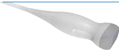
SP2430 Cardiac, Transcranial, Abdominal, Ob/Gyn, Vascular Phased Array