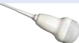
BC431 Abdominal, Ob/Gyn, Contrast Agents Procedures Variable-Band Bi-scan Volumetric Convex Array