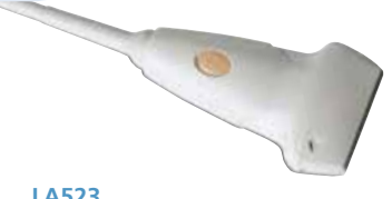
LA523 Vascular, Small Parts, Contrast Agents Procedures, Rheumatology, Anaesthesiology Variable-Band Linear Array