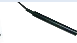
S5MCW Vascular Pencil Array - 5 MHz