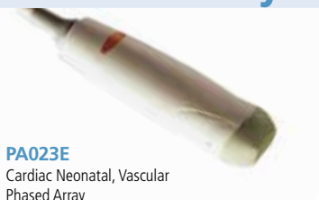
PA023E Cardiac Neonatal, Vascular Phased Array