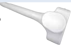
IOT342 Intraoperative, Abdominal, Small Parts, Pediatric, Vascular T-shape Linear Array