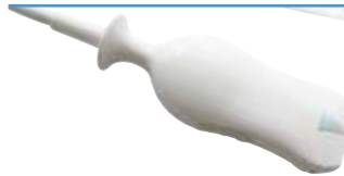
SL3235 appleprobe Small Parts, Vascular, Rheumatology, Anaesthesiology Wideband Linear Array