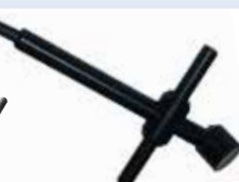
S2MCW Cardiac, Abdominal, Pediatric Pencil Array - 2 MHz