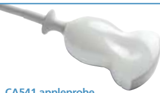
CA541 appleprobe Abdominal, Ob/Gyn, Small Parts, Vascular, Cardiac, Pediatric, Urology, Contrast Agents Procedures Convex Array