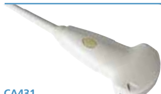
CA431 Abdominal, Ob/Gyn, Vascular, Contrast Agents Procedures Variable-Band Convex Array