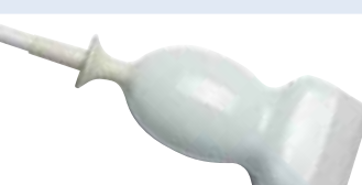
BL433 appleprobe Rheumatology, Small Parts, Vascular Bi-scan Linear Array