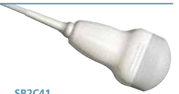
SB2C41 Abdominal, Ob/Gyn Variable-Band Bi-scan Volumetric Convex Array