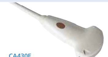
CA430E Abdominal, Ob/Gyn, Vascular, Contrast Agents Procedures Variable-Band Convex Array