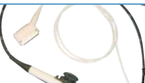
ST2612 Cardiac Phased Array