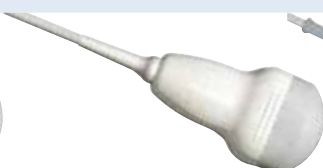
BC441 Abdominal, Ob/Gyn, Contrast Agents Procedures, 3D biopsy Variable-Band Bi-scan Volumetric Convex Array