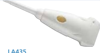
LA435 Vascular, Small Parts, Pediatric, Rheumatology, Anaesthesiology Linear Array