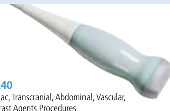
PA240 Cardiac, Transcranial, Abdominal, Vascular, Contrast Agents Procedures Variable-Band Phased Array