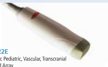
PA122E Cardiac Pediatric, Vascular, Transcranial Phased Array