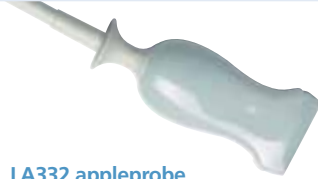
LA332 appleprobe Vascular, Pediatric, Small Parts, Contrast Agents Procedure, Variable-Band Linear Array