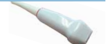
SL3116 Rheumatology, Anaesthesiology, Vascular, Neonatal Linear Array