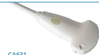
CA631 Abdominal, Ob/Gyn, Vascular, Contrast Agents Procedures Variable-Band Convex Array