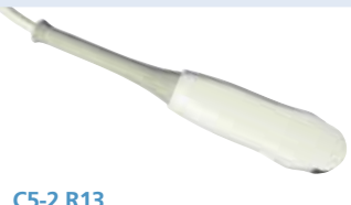
C5-2 R13 Cardiac, Pediatric, Vascular Micro-Convex Array