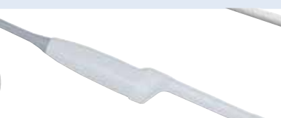
BE1123 Ob/Gyn, Urology, Transvaginal, Transrectal Micro-Convex Array