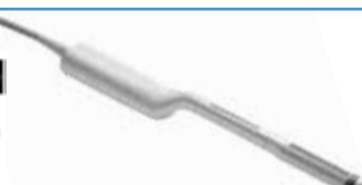
TRT33 Bi-plane Transrectal, Transvaginal Micro-Convex Array & Linear Array

Probe compatibility is system/configuration dependent. Specifications subject to change without notice. Information might refer to products or modalities not yet approved in all countries. The use of contrast agents in the USA is limited by FDA to left ventricle opacification and visualization of the left ventricular endocardial border. For further details, please contact your Esaote sales representative.