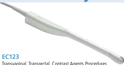
EC123 Transvaginal, Transrectal, Contrast Agents Procedures Variable-Band Micro-Convex Array