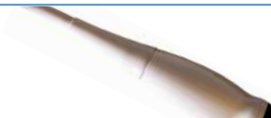
SP2442 Cardiac, Vascular, Neonatal Cephalic, Pediatric Phased Array