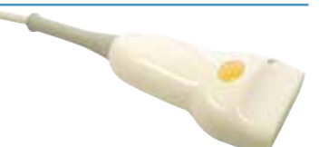
SL3413 Vascular, Small Parts, Rheumatology, Anaesthesiology Linear Array