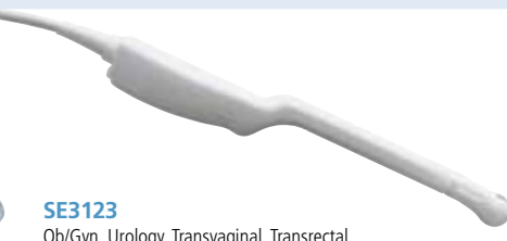
SE3123 Ob/Gyn, Urology, Transvaginal, Transrectal Micro-Convex Array