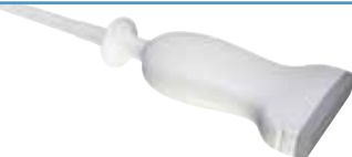
SL1543 appleprobe Vascular, Small Parts, Abdominal, Cardiac Linear Array