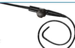
TEE022 Multiplane Cardiac Phased Array