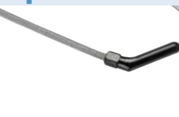
IOE323 Intraoperative, Vascular, Small Parts Linear Array