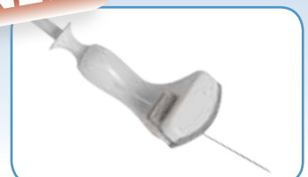
0 degrees biopsy-interventional probe