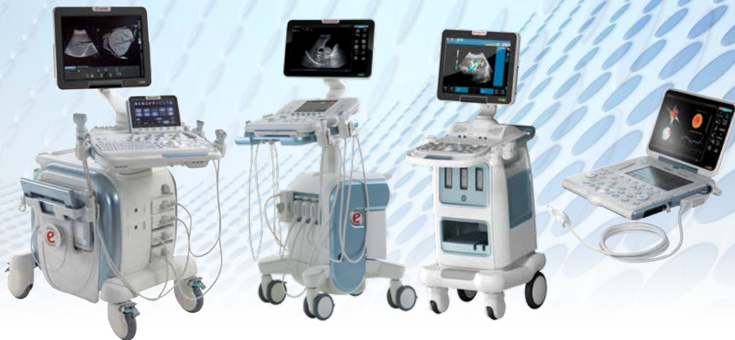
MyLab ™ Twice