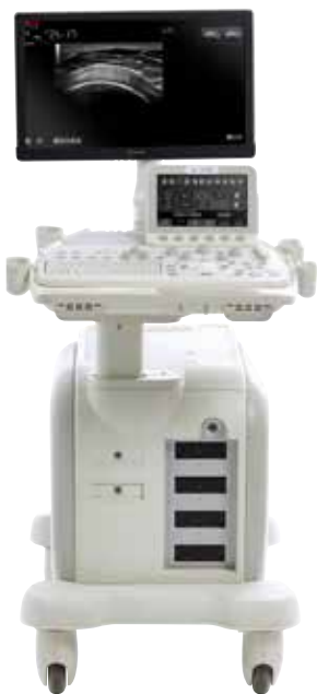
My Lab™ Eight