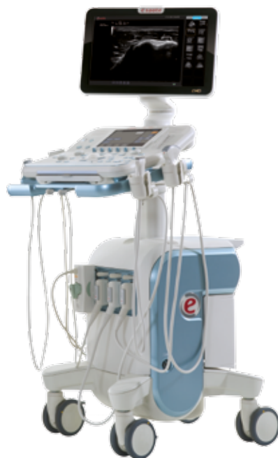
My Lab™ Seven