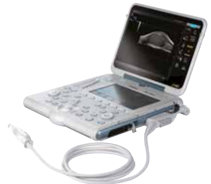
My Lab™ Alpha