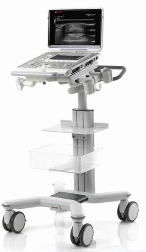
XStrain™ and AutoEF - high sensitivity and spatial resolution hemodynamic evaluation for tissue perfusion