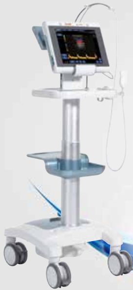
MyLab TM Touch