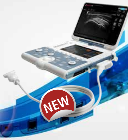
MyLab TM Gamma