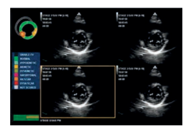
Complete Stress Echo package with flexible and customizable protocols for imaging acquisition and review.