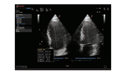
Automatic measurement of the EF fraction (entirely automated).