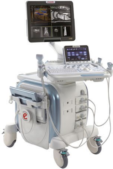
MyLab™ Twice @HD Technology

@HD is the Esaote technology to innovate ultrasound imaging and improve the systems' use. It represents our attention to the diagnostic value, optimizing all the aspects of the chain a signal has to travel through, starting from the echo generated by the patient's body up to the arrival on the system's monitor. It maximizes the efficiency of ultrasound scanning, leaving the sonographer free to concentrate on the patient.