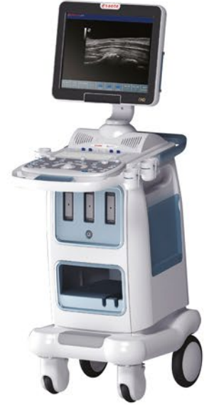
MyLab™ 40 @HD Technology