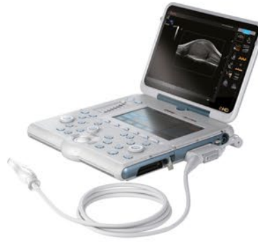
MyLab™ Alpha @HD Technology