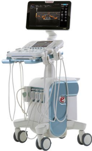
MyLab™ Seven @HD Technology