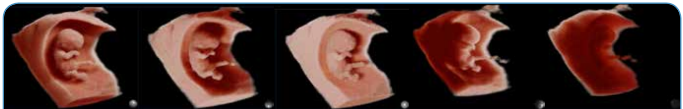
Changes in the rendering by moving the position of the virtual light source (on the right-bottom side of the picture)