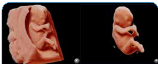
Cut to take off particular structures from the rendering