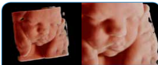
Zoom to better visualize the details of the face